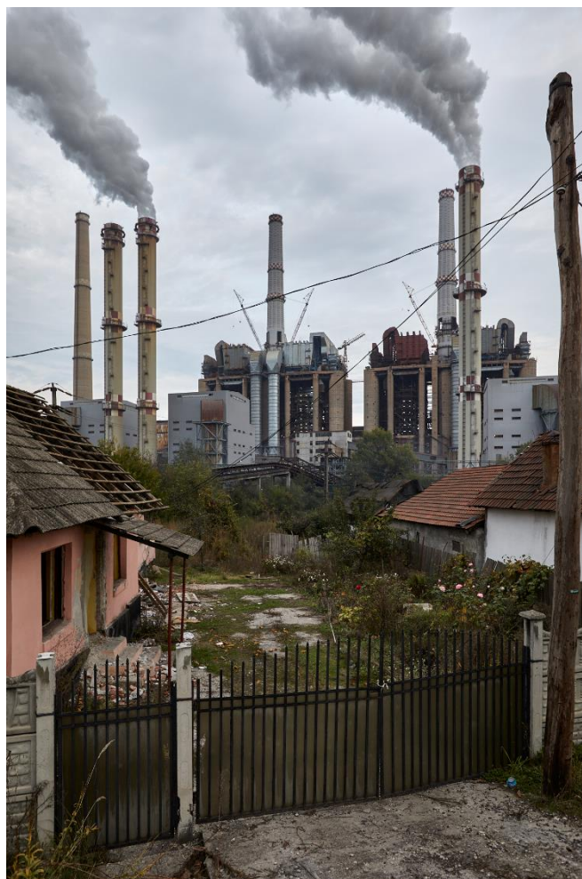
Rovinari coal power plant, Romania.

Slovakia has been developing Territorial Just Transition Plans for the Upper Nitra, Banskobystrický and Kosický regions. The Plans were submitted to the European Commission on 16 November 2021.