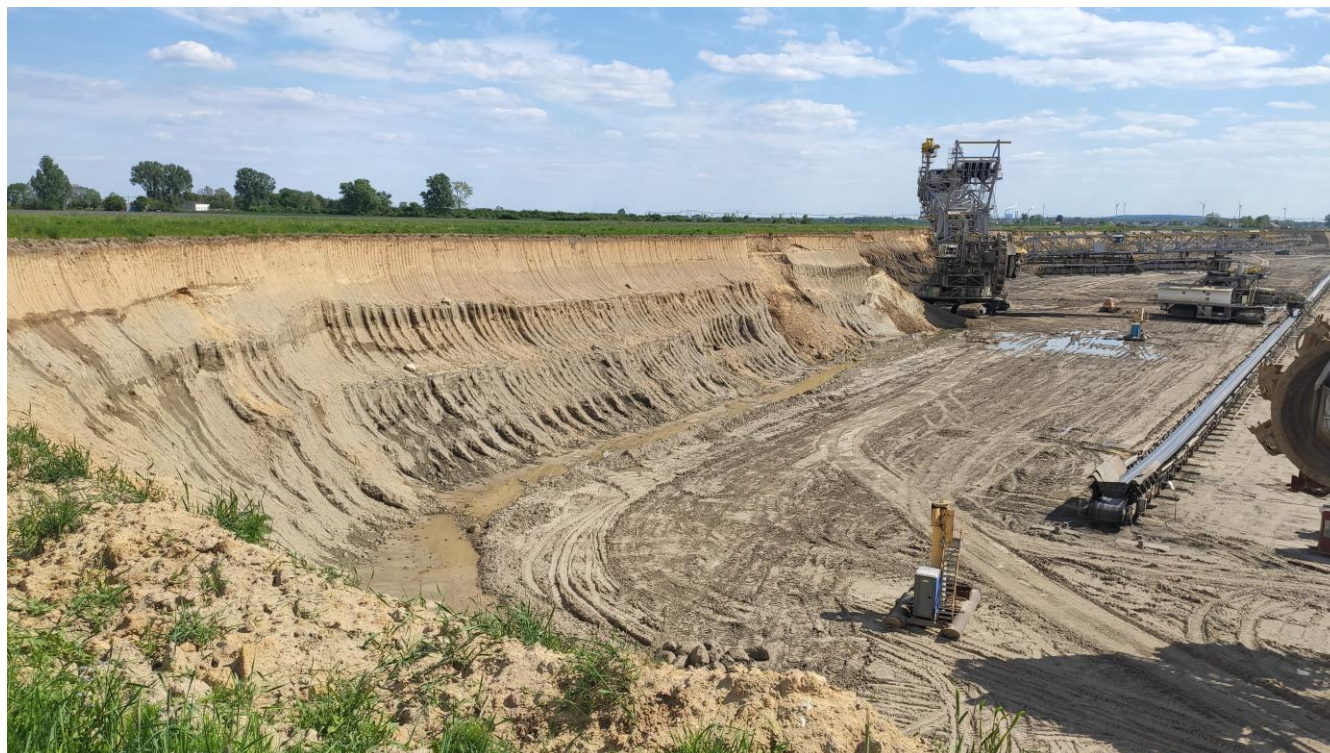
Konin lignite mine, Eastern Wielkopolska, Poland.

A Commission Staff Working Document on the Territorial Just Transition Plans was published on 23 September 2021. 15 The primary purpose of the document is to provide clarifications to the Commission staff working to provide feedback on the draft plans. The document provides useful explanations and outlines key criteria required for approval of the Plans.